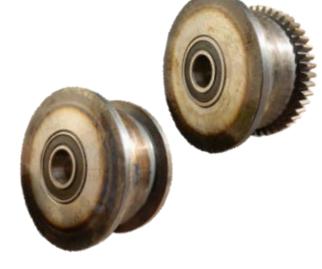
Wheels range from 5" to 20" diameter and hardened to 450-500 Brinell, the hardest in the industry.