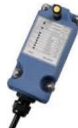
400 Series Receiver