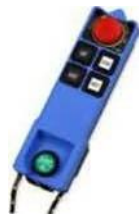
400 Series Transmitter