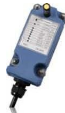
400 Series Receiver