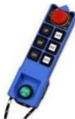
400 Series Transmitter