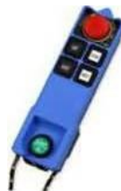
400 Series Transmitter