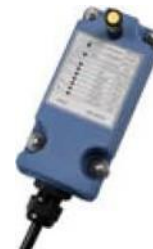
400 Series Receiver